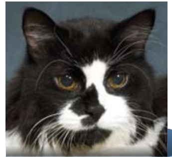
Healthy senior cats should see the veterinarian every 6 months.

Just as with people, it’s important for feline patients to see their doctors more frequently as they age. During a senior wellness exam, your veterinarian will screen your pet for a variety of age-related health concerns. A thorough senior wellness exam is designed to: